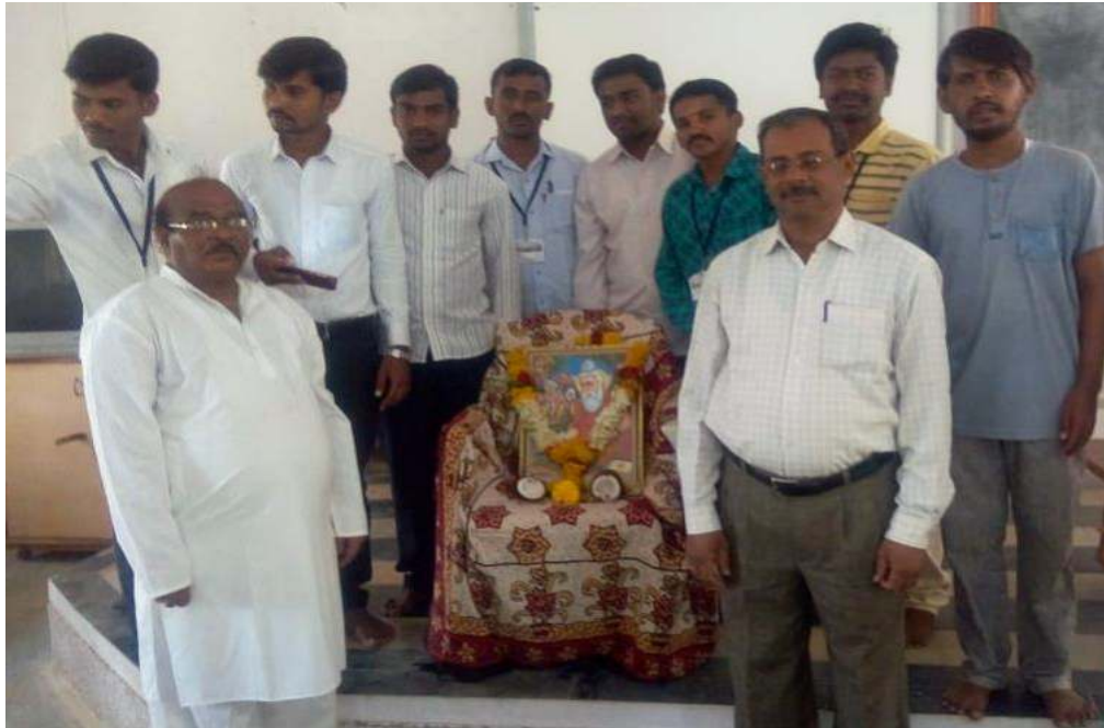
Shri Vijaymahantesh VidyaVardhak Sangh's S. R. KANTHI COLLEGE OF EDUCATION, ILKAL KARNATAKA RAJYOSTAVA