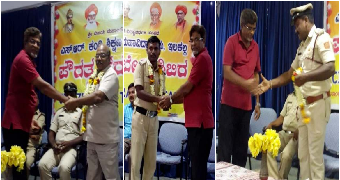
Shri Vijaymahantesh VidyaVardhak Sangh's S. R. KANTHI COLLEGE OF EDUCATION, ILKAL