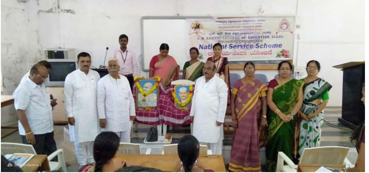
Shri Vijaymahantesh VidyaVardhak Sangh's S. R. KANTHI COLLEGE OF EDUCATION, ILKAL VALMIKI JAYANTI