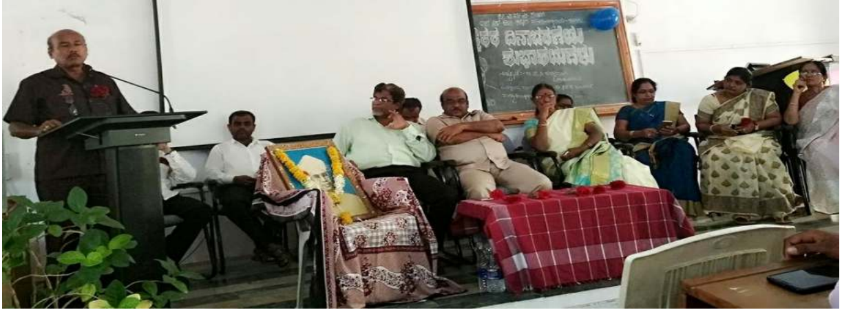
Shri Vijaymahantesh VidyaVardhak Sangh's S. R. KANTHI COLLEGE OF EDUCATION, ILKAL GANDHI JAYANTI , SHASTRI JAYANTI & INAUGUTATION OF NSS