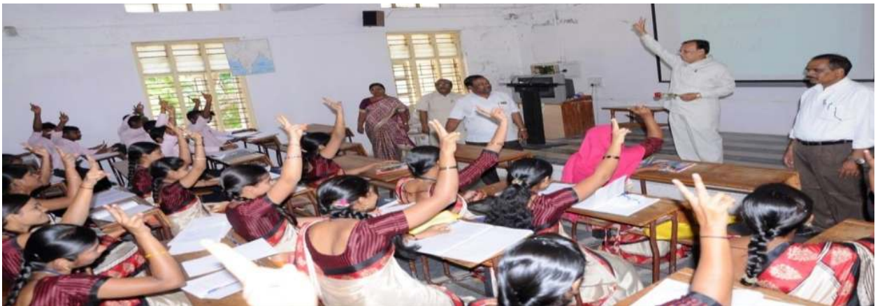
Shri Vijaymahantesh VidyaVardhak Sangh's S. R. KANTHI COLLEGE OF EDUCATION, ILKAL CTC- CAMP