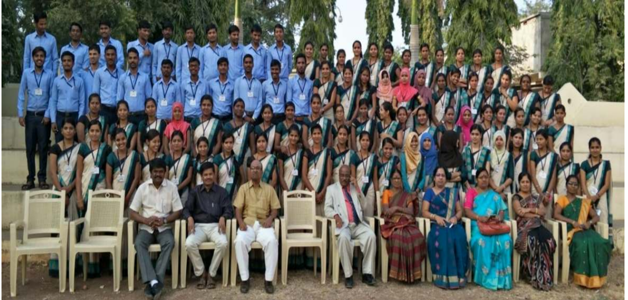
Shri Vijaymahantesh VidyaVardhak Sangh's S. R. KANTHI COLLEGE OF EDUCATION, ILKAL DEEPADAN SAMARAMBA